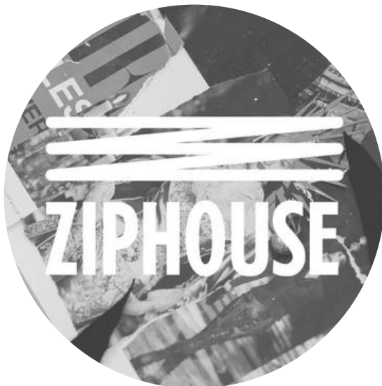
ZIPHouse Fashion Innovation Hub