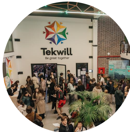
Tekwill ICT Excellence Center